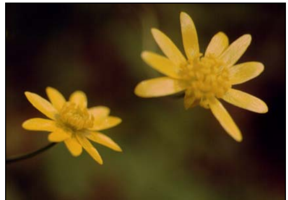
Ranunculus californicus var. californicus (California Buttercups)

Los Angeles and Southern California residents will have a chance to explore their growing interest in natives at 31 private and public gardens during the third annual Theodore Payne Native Plant Garden Tour on Saturday and Sunday, April 1 and 2, from 10am to 4pm. Gardens throughout the Los Angeles Basin will be featured, from Monrovia to Santa Monica, from Madrona Marsh in Torrance to Quail Hollow in Tujunga. See the Theodore Payne Foundation Garden Tour link on our website for more information.