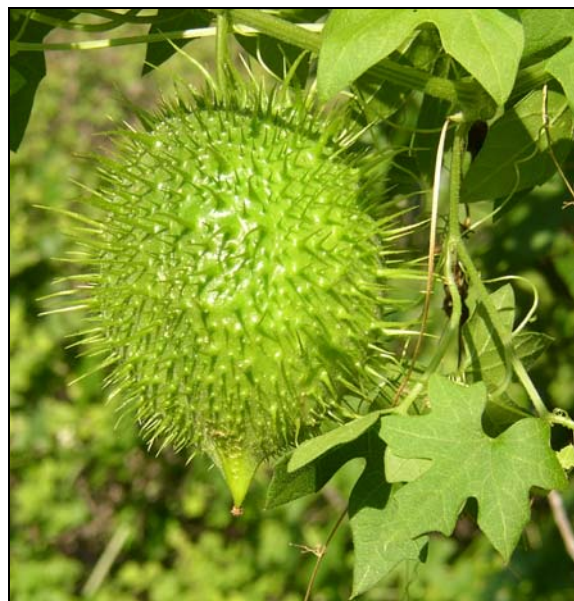
Marah macrocarpus var. macrocarpus (Large-fruited Man-root)