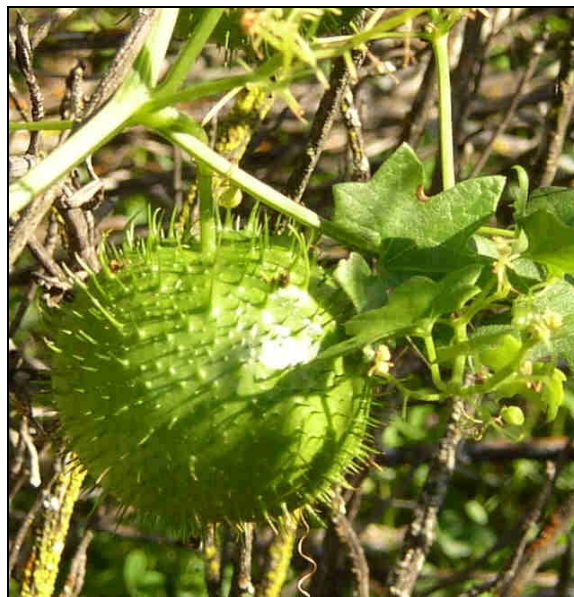
Marah fabaceus var. agrestis (California Man-root)