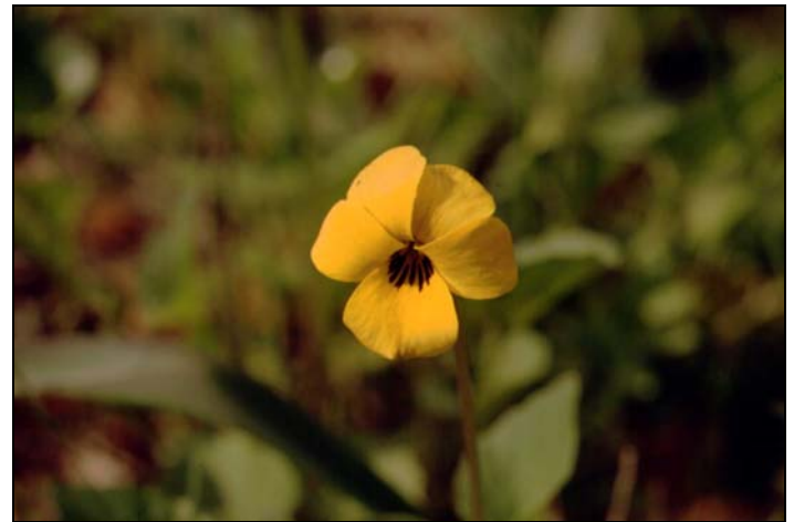
Viola pedunculata spp. pedunculata (Johnny-jump-up)

www.cnpsci.org ... weekly to view updates and new current events like these.