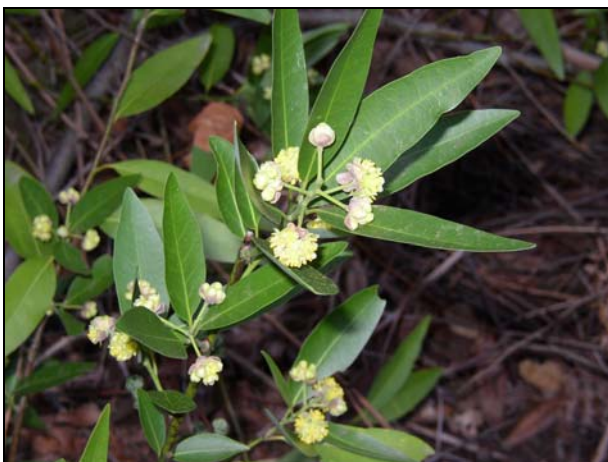
Umbellularia californica var. californica (California Bay)

Sponsored by the California Coastal Conservancy.